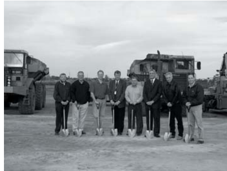
Prairie Market Groundbreaking

Prairie Market is located on the south side of Route 34, at Fifth Street. Not only has infrastructure work begun on the center, but all five of their major tenants will start construction this spring: Wal-Mart Supercenter, Kohl's, Lowe's, Best Buy, and Dick's Sporting Goods. In addition, another tenant has recently been announced for this center: TGI Friday's. Several other national retailers and restaurants are close to signing agreements to locate at Prairie