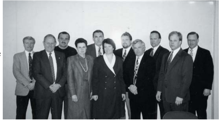
The original OEDC Board of Directors March 1996