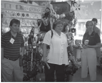
Participants of the Familiarization Tour at the Marmalade Tree in Downtown Oswego

On August 24 the bureau held a Familiarization Tour for seven members of the media who were treated to a half day to "Discover Oswego's Hidden Treasures". The tour began at the Village Grind and then a walking tour of downtown Oswego. From there the group boarded a bus for stops at the AmericInn Lodge & Suites, the Holiday Inn Express Hotel & Suites, and the Fox Valley Winery. The day ended with lunch at Emmett's Ale House in downtown Oswego. The event was a great success, and another tour will be planned for next year.