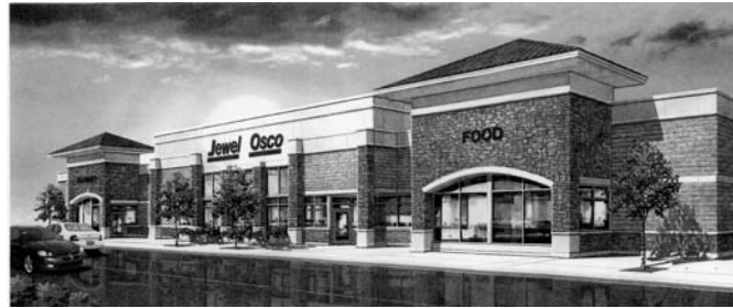
The proposed Jewel on Orchard Rd.

Jewel is important, because it is the first "big box" to locate in the Orchard Road corridor, which stretches from Route 34 to Galena Rd. in Oswego. With an anchor store now confirmed, it will be easier to attract other national tenants to Orchard Way. The Edward