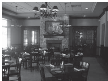
Emmett's Ale House

Starting in 1997, the OEDC has conducted surveys of Oswego residents to identify the types of commercial businesses that are most in demand. Local consumers have consistently asked the OEDC to attract a larger variety of restaurants. Ten years ago, many, if not most, Oswego residents spent their dining