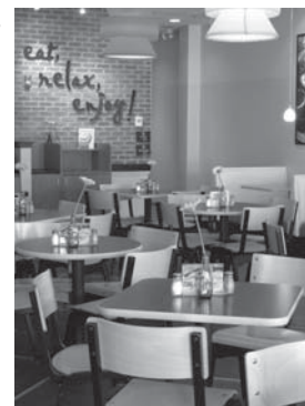
Camille's Sidewalk Cafe

pancake house, The Southern Belle, which will open later this year. Petey Z's is an upscale Italian restaurant that has relocated to Oswego from downtown Naperville.